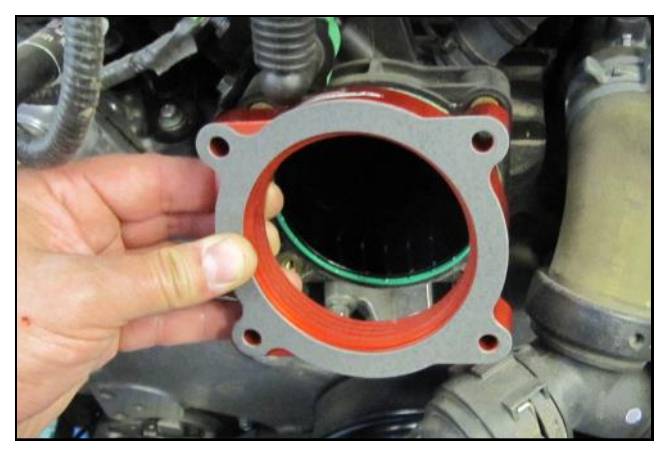
3. Install the Poweraid Spacer between the throttlebody and the intake manifold with the supplied gasket next to the throttlebody as shown. Make sure the "flow" arrow that is printed on the spacer is pointing towards the intake manifold.