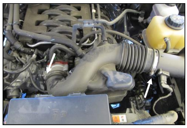
5 . Reinstall the intake tube, tighten the two hose clamps, and reconnect the breather line or lines.