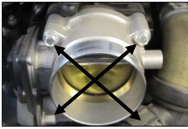
2. Remove the four bolts that secure the throttlebody to the intake manifold and set them aside. They will not be reused.